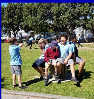
Fun games at lunchtime!