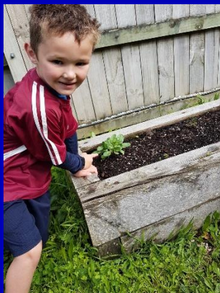
Busy bees in our school garden planting some of the New World Little Garden plants.