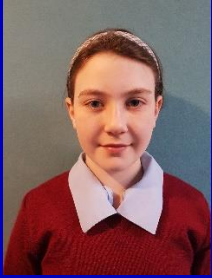
Anastasia – Kakapo