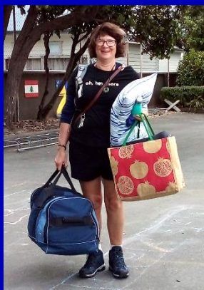
All ready for camp!