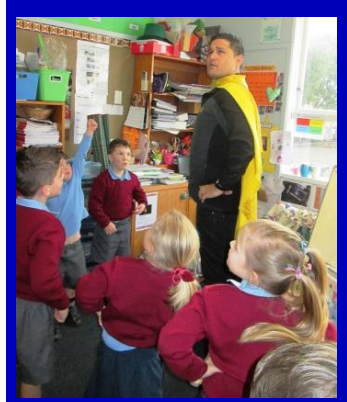
The Junior classes all had a session with Vane from ASB last week. Tui loved being their own supersaver heroes.