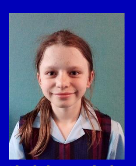
Shvlah — Pukeko